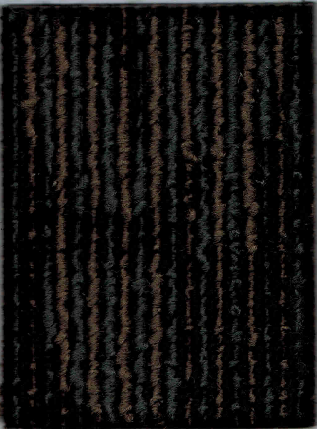
4013 Black Canvas