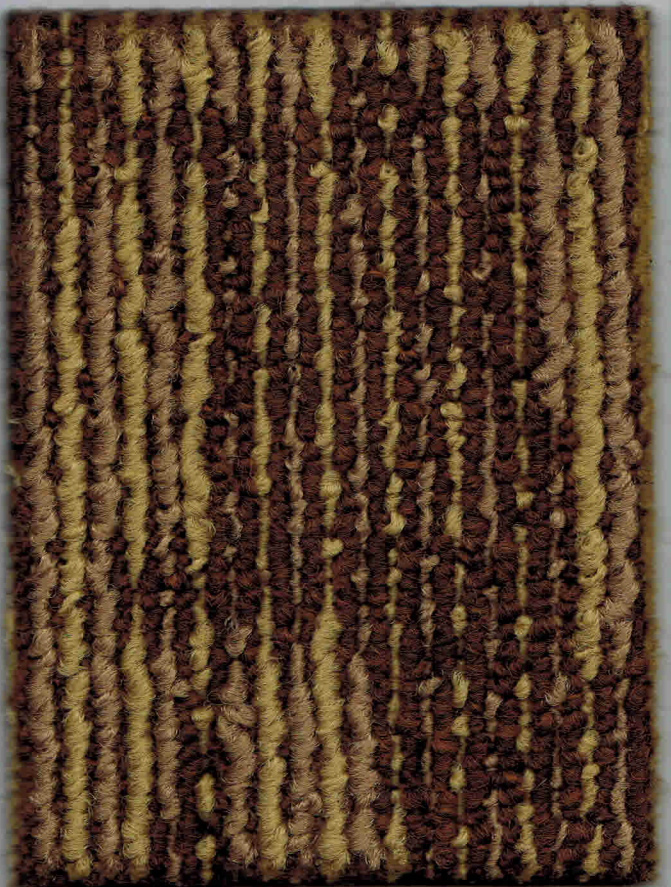
4012 Dark Teal