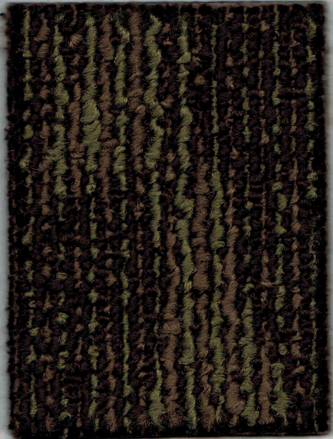
4015 Mint Green