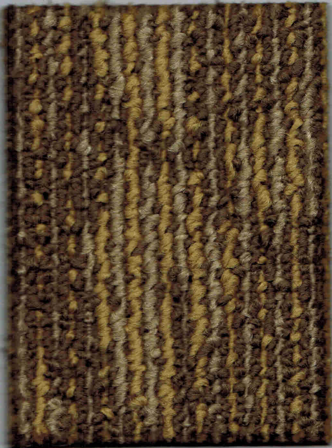
4011 Navy Blue

Solution Dye • Anti-Static • ECO Back - "PVC Free" • Flame-retardant